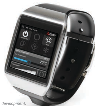
Smartwatch app currently in development.

Adjust the intensity of the fan speed and choose a specific direction or swing.